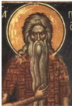
Ven. Paul of Thebes