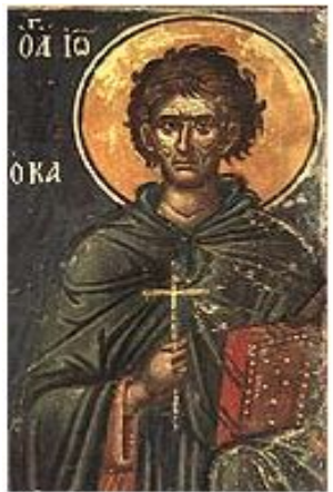
Venerable John Calabytes (the Hut-dweller”

GOSPEL LUKE 18:18-27 Now a certain ruler asked Him saying, “Good Teacher, what shall I do to inherit eternal life?” So Jesus said to him, “Why do you call Me good? No one is good but One, that is, God. You know the commandments: ‘Do not commit adultery,’ ‘Do not murder,’ ‘Do not steal,’ ‘Do not bear false witness,’ ‘Honor your father and your mother.’ And he said, “All these things I have kept from my youth.” So when Jesus heard these things, He said to him, “You still lack one thing. Sell all that you have and distribute to the poor, and you will have treasure in heaven; and come, follow Me.” But when he heard this, he became very sorrowful, for he was very rich. And when Jesus saw that he became very sorrowful, He said, “How hard it is for those who have riches to enter the kingdom of God! For it is easier for a camel to go through the eye of a needle than for a rich man to enter the kingdom of God. And those who heard it said, “Who then can be saved?” But He said, “The things which are impossible with men are possible with God.”