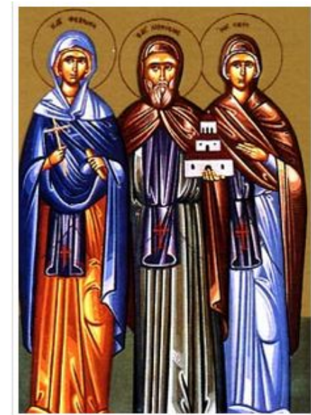
Virgin martyr Febronia of Nisibis

v: Save the King, O Lord, and hear us on the day we call! (Ps 19/20:9)